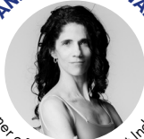
Owner of School of Ballet Indiana