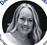
Owner of JDA Dance Company